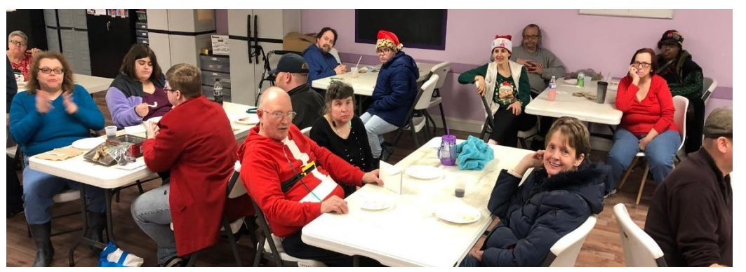
Holiday Feast & Gift Exchange